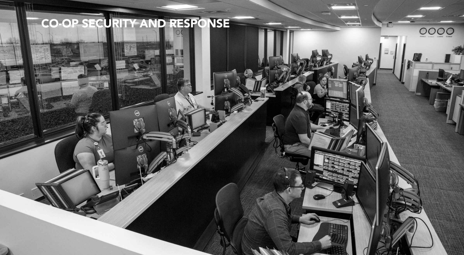
Basin Electric Security and Response Services dispatchers take calls from rural electric cooperative members at Basin's headquarters in Bismarck, N.D.