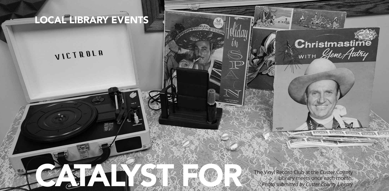
The Vinyl Record Club at the Custer County Library meets once each month.