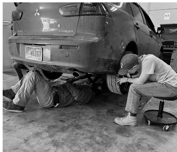
Harrisburg students working on a car in the automotive class.

"Statewide, 82% of high school students graduated on time in the 2021-22 school year, but 94% of students who were actively involved in CTE graduated on time," she said.