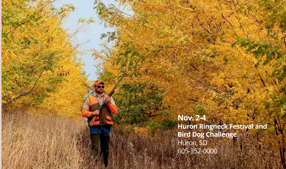
Nov. 2-4 Huron Ringneck Festival and Bird Dog Challenge Huron, SD 605-352-0000

To have your event listed on this page, send complete information, including date, event, place and contact to your local electric cooperative. Include your name, address and daytime telephone number. Information must be submitted at least eight weeks prior to your event. Please call ahead to confirm date, time and location of event.