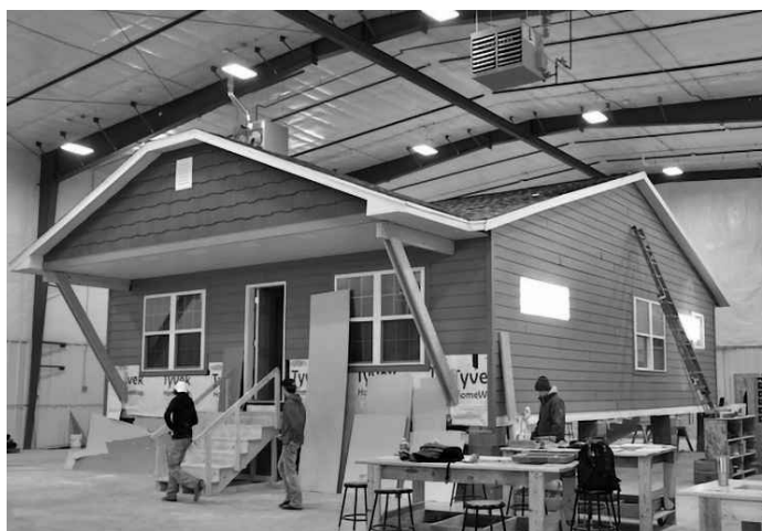
Students in the Harrisburg School District's home builders academy have built a full house.